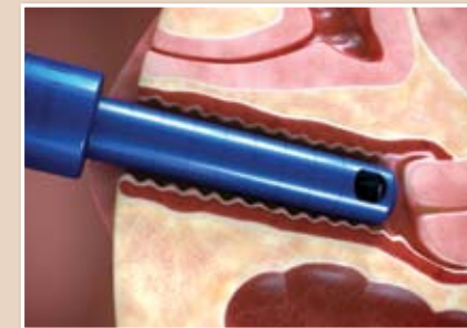
Your physician will move the sterilized applicator along the vaginal wall in an outward motion, applying the laser in a 360° pattern covering the entire area.